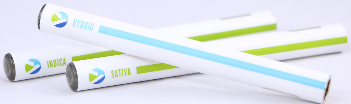
Pictured: Indica, Sativa, and 1:1 Vaporizer Units

If your vaporizer unit is not working, contact Liberty Health Sciences at (833) 254-4877 or www.aphria.com . Receipt of purchase is required for product return or exchange within three months of purchase. Free replacement is available for functional defects within the warranty period. Guarantee voided for the following conditions: damage due to operator misuse or abuse; damage due to a non-manufacturer disassembly or repair; damage due to a natural disaster.